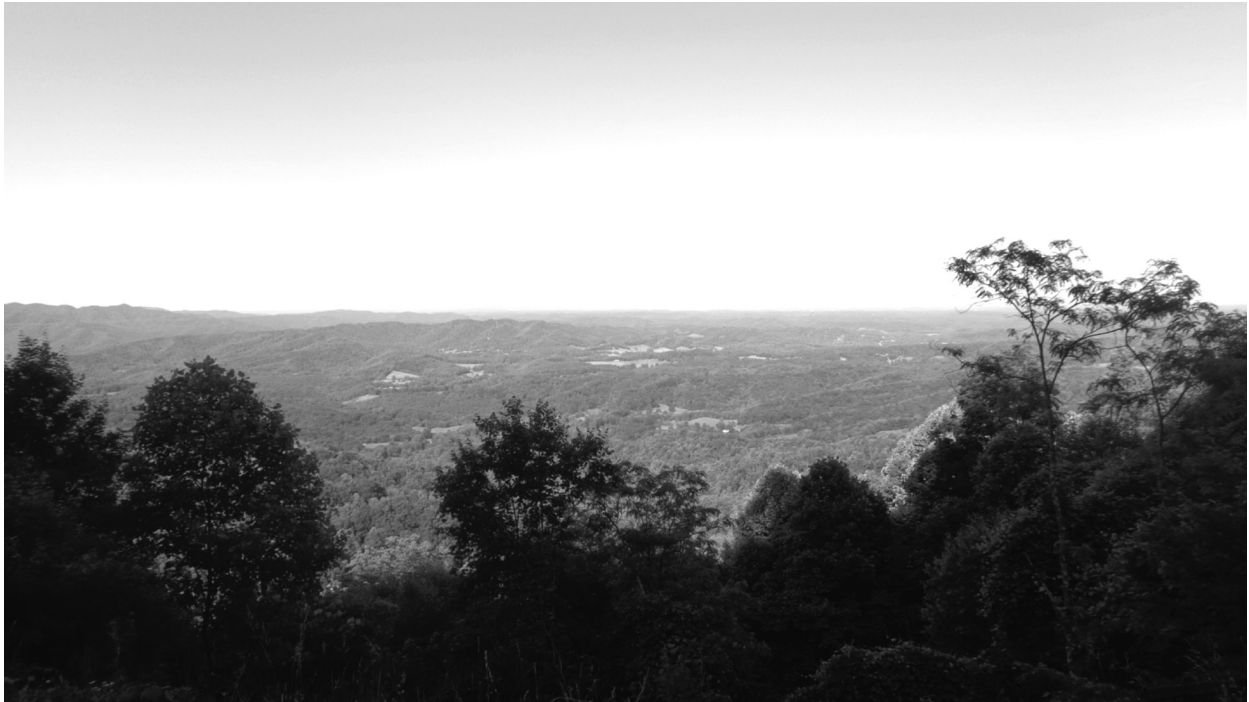
View from atop Bolt Mountain, Raleigh County Cover Photo: R. D. Bailey Lake, Wyoming County