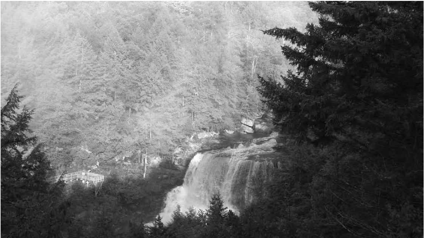
BLACKWATER FALLS, TUCKER COUNTY, WV