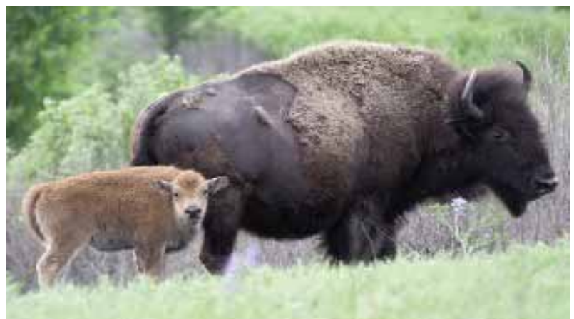
Distinguished by their large head, horns, and shoulder hump, the AMERICAN BISON, (Bison Bison), is an icon of the Great Plains and in 1955 became the state mammal of Kansas. Considered the largest North American land mammal, bison can weigh up to one (1) ton, have thick brown fur and both adult male and female have curved horns. Bison calves are born an orange/rust color that changes as they grow older. Despite their large size, bison are quick and agile, running up to forty (40) miles per hour and can jump higher than six (6) feet. KDWP has three publicly owned bison herds for viewing these majestic animals: Sand Sage Bison Range (Garden City), Maxwell Wildlife Refuge (Canton), and Mined Land Wildlife Area #1 (Pittsburg).