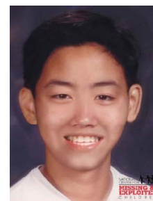
Age Progressed to Age 14