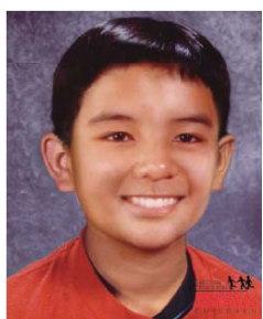
Age Progressed to Age 10