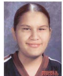
Age Progressed to Age 17

AGE NOW 18 yrs AGE 15 yrs old HGT 5 ft. 1 in. WGT 180 lbs. HAIR Brown EYES Brown RACE Caucasian, Asian