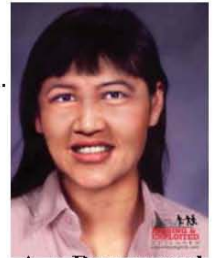
Age Progressed to 27

CURRENT AGE 32 yrs MISSING AGE 12 yrs HEIGHT 4 ft. 11 in. WEIGHT 75 lbs. HAIR Black EYES Brown RACE Chinese