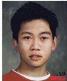
Age Progressed to Age 14

AGE NOW 16 yrs AGE 8 yrs HGT 4ft WGT 45-50lbs HAIR Black EYES Brown RACE Filipino, Hawaiian